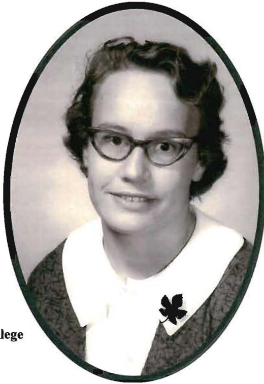
McPherson College Picture 1966